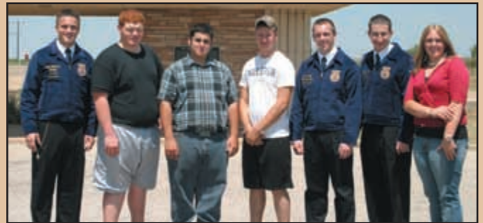
Boys Ranch FFA officers take a moment to pose with national, regional and state officers who visited the campus.

Three special guests were welcomed to Boys Ranch during the first week of school in August. The national FFA president, eastern regional FFA vice president and the Texas state president were treated to a tour and meal at Boys Ranch during their brief stay.