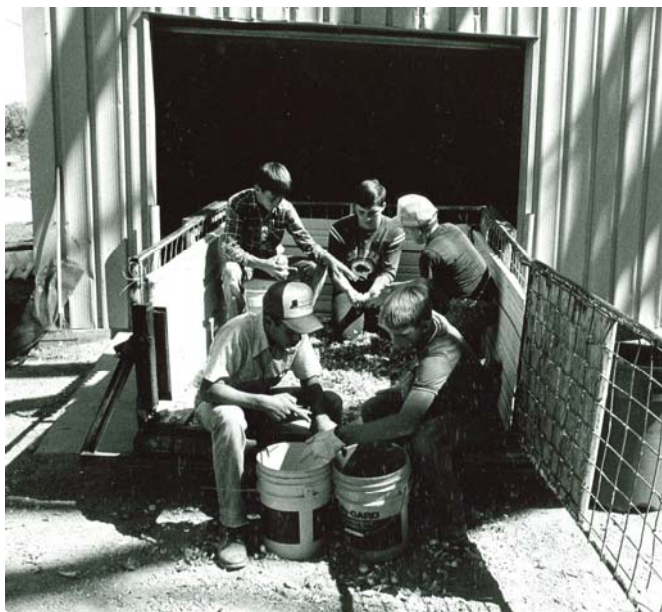
August 1984 Peeling onions

For more information, contact the Alumni Association